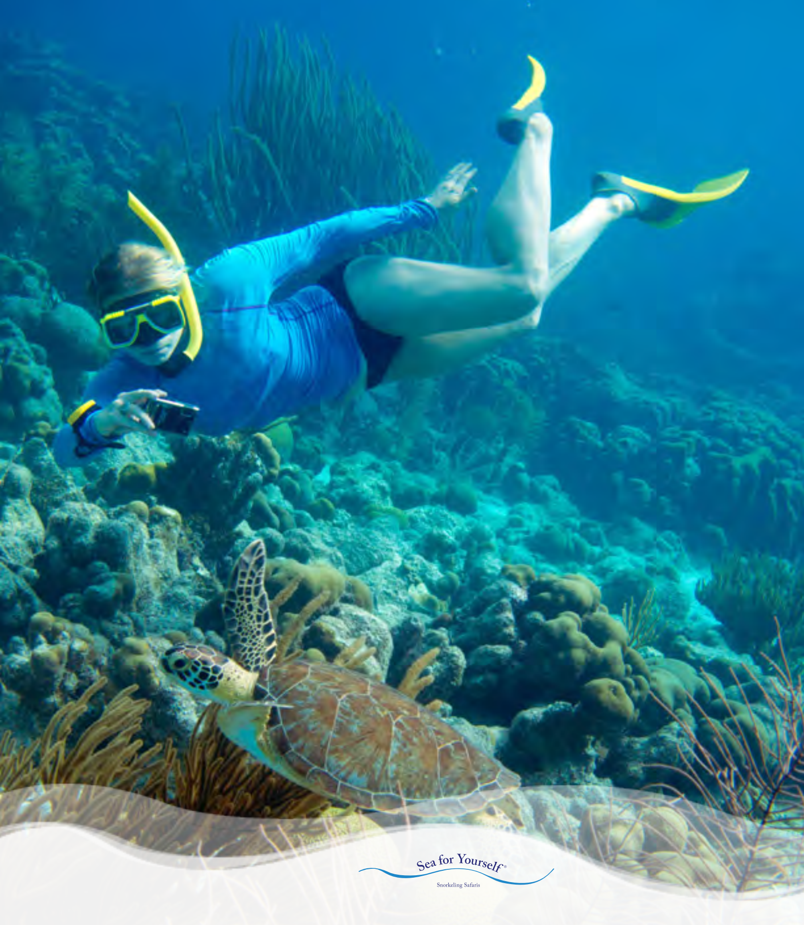
Exploring Bonaire - a fish lover's paradise March 23-30, 2024